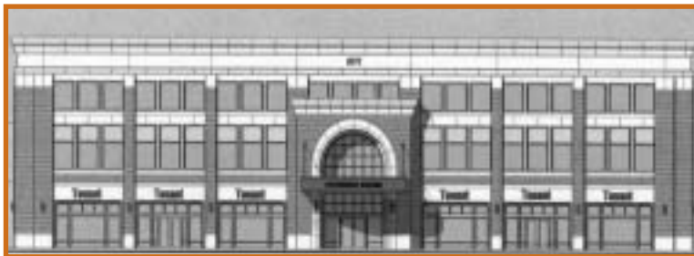
The Center on Seven Bridges Drive