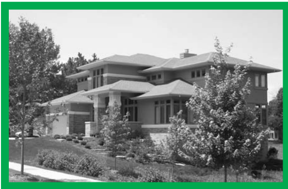
Home in Normadale Woods Subdivision

Current single-family housing developments underway include: Farmingdale Village Unit 25, Walnut Court, Oakwood Hills, Normadale, and Oak Bluff Estates subdivisions. Multi-family housing developments include the Seven Bridges and Gallagher and Henry condominiums.